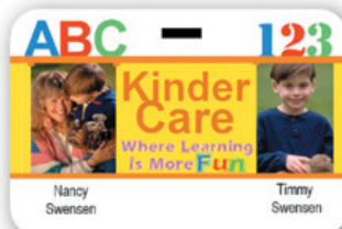
Photo ID Badges