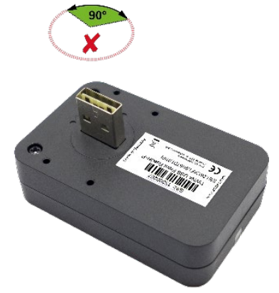
TWN4 USB Front Reader Bottom view (360° mounting possibility)

The TWN4 USB Front Reader integrates RFID (125 kHz and 13.56 MHz), NFC and Bluetooth Low Energy capabilities into a compact but powerful reader. Thanks to its patented turnable USB connector, which offers a 360° mounting opportunity, the reader can be easily connected to an external USB port. Furthermore, it is equipped with a USB hub that can optionally be disabled. Its reduced size combined with excellent read/write performance makes it the perfect reader for various applications, including but not limited to print solutions and single sign-on.