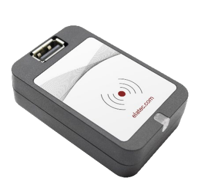
TWN4 USB Front Reader Top view (inlay customizable)