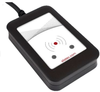
TWN4 MultiTech (inlay customizable)

ELATEC's TWN4 family of transponder readers and writers allows users to read and write to almost any 125 kHz, 134.2 kHz and 13.56 MHz tags and/or labels. It supports all major transponders from various suppliers like ATMEL, EM, ST, NXP, TI, HID, LEGIC, etc. and ISO standards like ISO14443A/B (T=CL), ISO15693, ISO18092 / ECMA-340 (NFC).