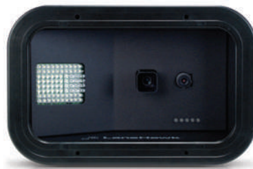
LaneHawk Intelligent Lighting and Camera Unit

The Enterprise Manager keeps track of LaneHawk lane status, software updates, modelsets, and most importantly, generates reports to detail cashier performance.