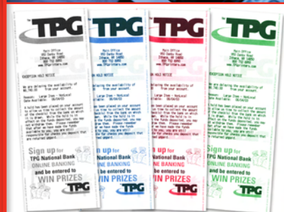
Receipt Marketing Application