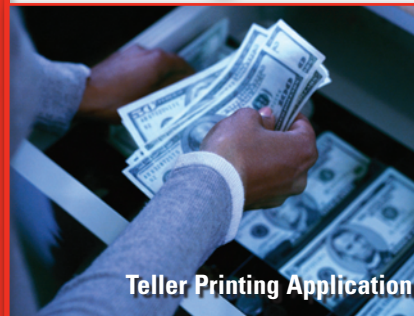
Teller Printing Application