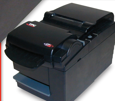
With Upgradable Imaging Module