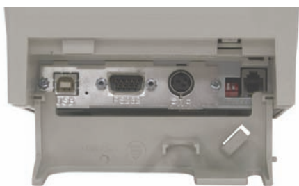
RS232 Serial/USB Interface Shown Above