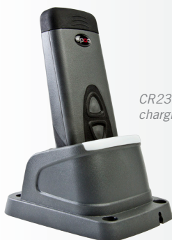
CR2300 with charging station.