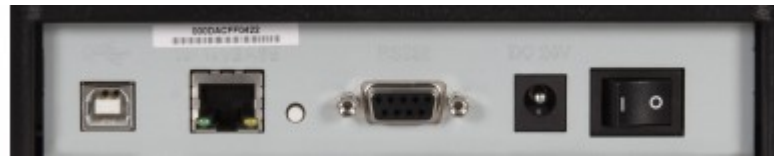
Ethernet LAN, USB and Serial interfaces as standard