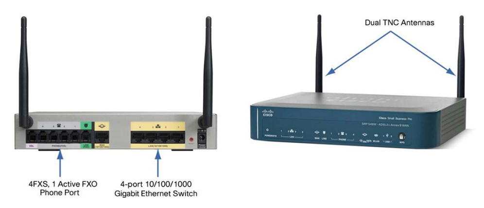
Table 1 lists details of all models in the Cisco SRP500 Series.