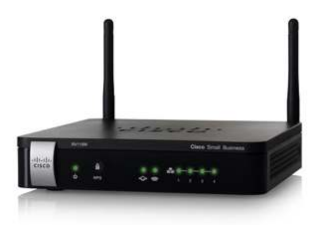
Figure 1. Cisco RV110W Wireless-N VPN Firewall

The Cisco® RV110W Wireless-N VPN Firewall provides simple, affordable, highly secure, business-class connectivity to the Internet for small offices/home offices and remote workers.