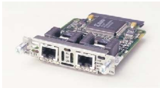
Figure 1. Cisco Dual Port T1/E1 Multiflex Voice/WAN Interface Card

VWIC-1MFT-T1, VWIC-2MFT-T1, VWIC-2MFT-T1-D1, VWIC-1MFT-E1, VWIC-2MFT-E1, VWIC-2MFT-E1-DI, VWIC-1MFT-G703, VWIC-2MFT-G703