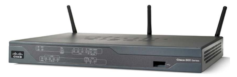
Figure 1. Cisco 881 Integrated Services Router with Integrated 802.11n Access Point

Tables 1 and 2 list the routers that currently make up the Cisco 880 data, voice and SRST series, respectively.