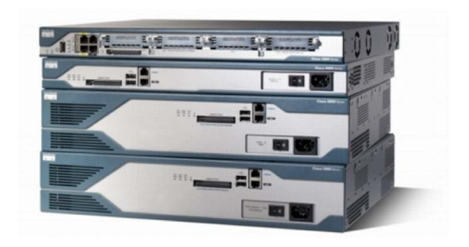
Figure 1. Cisco 2800 Series

Cisco Systems<sup>®</sup>, Inc. is redefining best-in-class enterprise and small- to- midsize business routing with a new line of integrated services routers that are optimized for the secure, wire-speed delivery of concurrent data, voice, video, and wireless services. Founded on 20 years of leadership and innovation, the Cisco<sup>®</sup> 2800 Series of integrated services routers (refer to Figure 1) intelligently embed data, security, voice, and wireless services into a single, resilient system for fast, scalable delivery of mission-critical business applications. The unique integrated systems architecture of the Cisco 2800 Series delivers maximum business agility and investment protection.