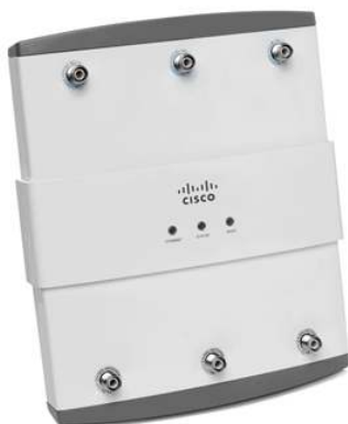
Figure 1. The Cisco Aironet 1250 Series Access Point

The platform was specifically engineered to support the power, throughput, and mechanical requirements of higher-speed WLAN technologies, including 802.11n. Currently, the platform provides both 2.4-GHz and 5-GHz modules compliant with the IEEE 802.11n draft 2.0 standard. As technology evolves, the platform is flexible to support future radio modules designed to deliver intelligent RF services, further enhancing the performance and reliability of the wireless network. The Cisco Aironet 1250 Series is a rugged indoor access point designed for both office and challenging RF environments such as factories, warehouses, hospitals and large retail establishments that require the antenna versatility associated with connectorized antennas, a rugged metal enclosure, and a broad operating temperature range. With a Gigabit Ethernet (10/100/1000) interface, the Cisco Aironet 1250 Series delivers line-rate throughput for higher-speed WLAN technologies such as 802.11n. The access point offers the flexibility of inline as well as local power options.