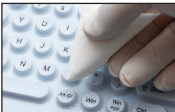
Easy to wipe down