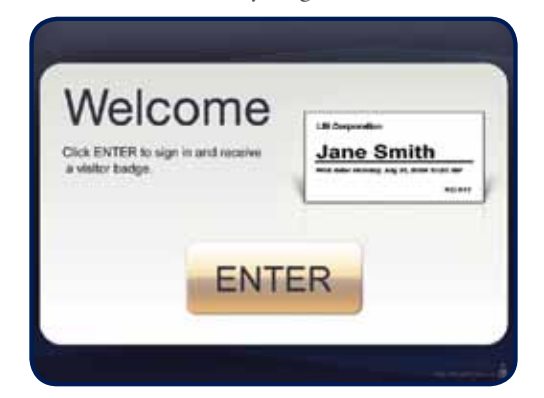
Self Check-in mode

For assisted check-in used by most organizations. Visitors arrive and someone on your staff – typically at the front desk or reception area – enters their data to generate a badge.