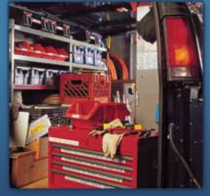
Print durable, self-adhesive, laminated labels for almost any application - indoors & outdoors