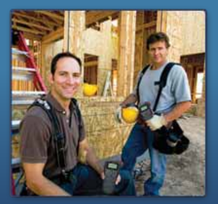
Full-featured labeling tool terrific value for your money. Equip your whole crew!