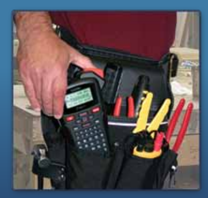
Compact & lightweight design easy to carry or store in a toolbox.

CT: DVD 67410-32, 100 Somerset Corporate Blvd, Bridgewater, NJ 08807