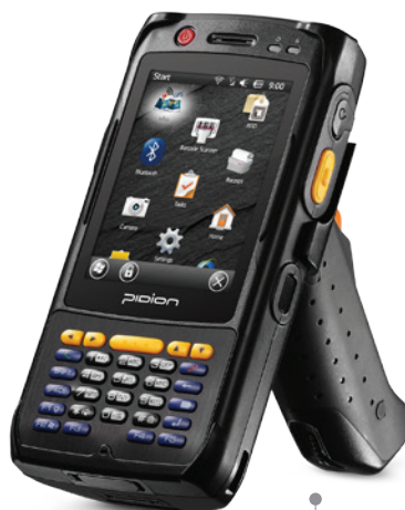
BIP-6000 MaxGrip Pistol Grip