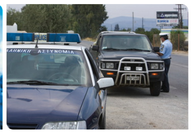
Logistics Construction Government/Public Sector