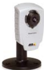
AXIS 207/207W/207MW Network Camera with camera stand - stand included