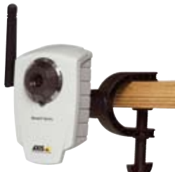
AXIS 207/207W/207MW Network Camera with flexible clamp - clamp included