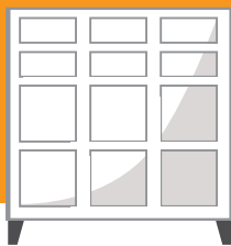
Axcess 6112.3 3-High 12-Door Locker Height: 41.7" Weight: 160 lbs.