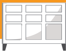
Axcess 6109.2 2-High 9-Door Locker Height: 29.6" Weight: 120 lbs.

Choose From a Variety of Flexible Configurations