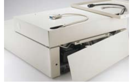
b | Cable Management Storage provided for power supplies and cables. Makes cable routing an easy process.