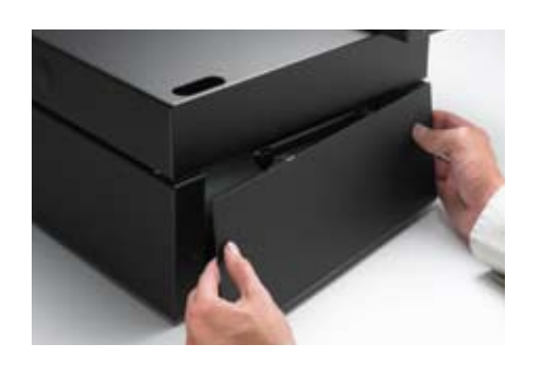
a | Removable Rear Panel Provides accessibility and trouble-free service.