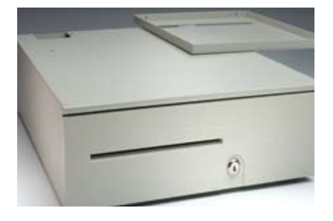
c | Printer Tray A sturdy tray that can be mounted on the left or right side of both the drawer or riser.