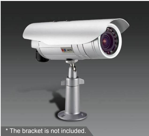
* The bracket is not included.