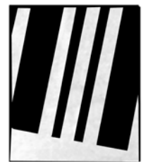
Thermal - 200 dpi