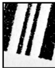
Laser - 400 dpi

Unlike dot matrix and laser printers, Zebra thermal printers produce crisp, clear print quality on all wristband and label sizes, so bar codes scan quickly and reliably. By getting a positive, accurate scan the very first time, you can immediately turn your focus to the patient.